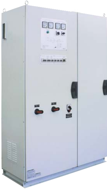
UPS 20 kVA