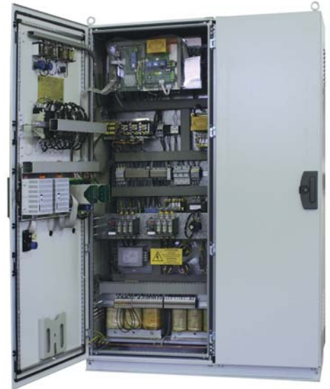
UPS 20 kVA - internal view